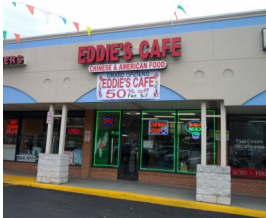
Grand Opening at Eddie's Cafe