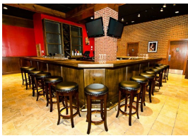
Interior of Arlington Location