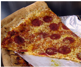
Jumbo Slice in Adams Morgan